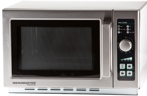
Model RCS511DSE shown